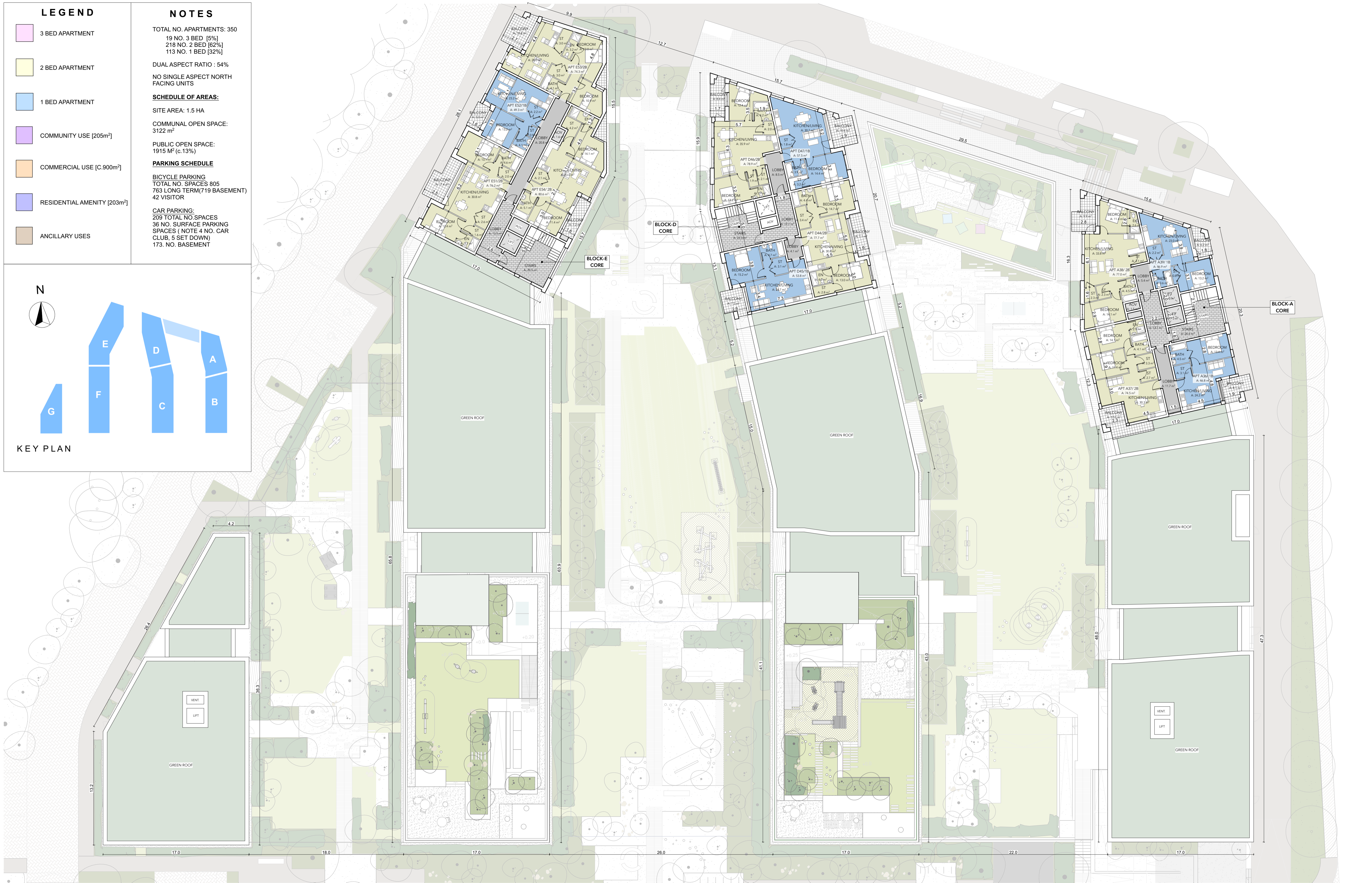
Eighth Floor Plan SCALE : 1:200